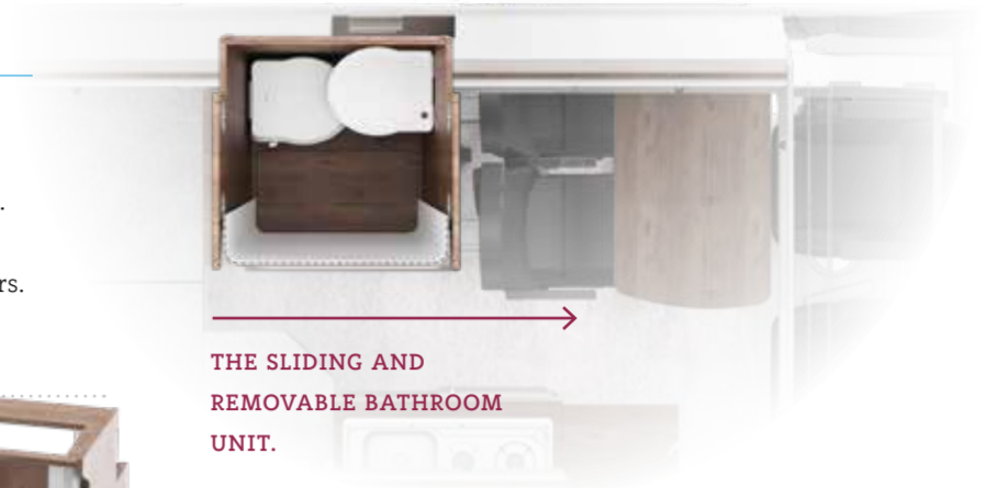
THE SLIDING AND REMOVABLE BATHROOM UNIT.

The entire wet cell is movable, removable and waterproof. A real "lightweight" thanks to the EPS core. The laminate guarantees a robust surface and leaves room for designers.