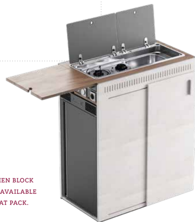
KITCHEN BLOCK ALSO AVAILABLE AS FLAT PACK.

More about product line VSTRONG vstrong.voehringer.com